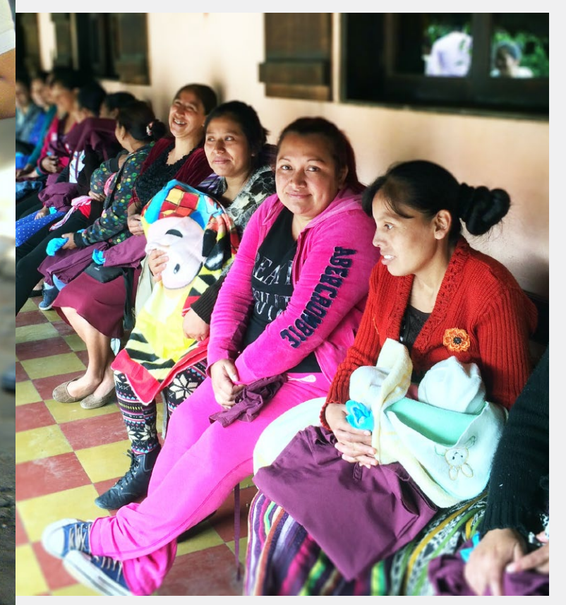
PATIENTS WAITING AT THE VSC CLINIC IN CHIMALTENANGO